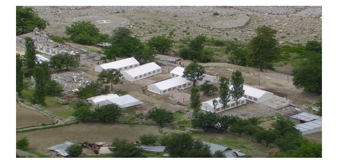
View of Final class Rooms